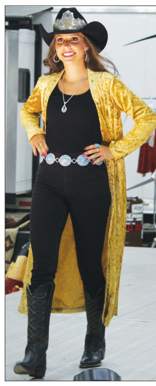
Miss Rodeo Minnesota walked the runway at the Rodeo and Rhinestones event in Buffalo. and also attended the Buffalo Rodeo over the weekend.

drinks as they awaited the by those who stopped by. It fashion show. The fashion was a great way to kick off was a great way to kick off the 2022 Buffalo Rodeo festivities.